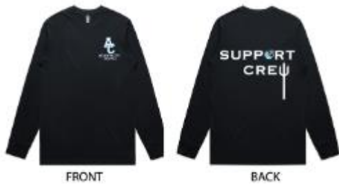
Mens Support Crew Tee Long Sleeved