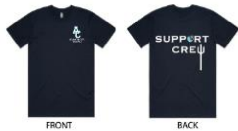
Mens Support Crew Tee Short Sleeved