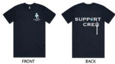
Womens Support Crew Tee Short Sleeved