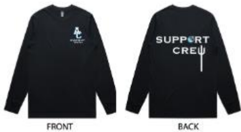
Womens Support Crew Tee Long Sleeved